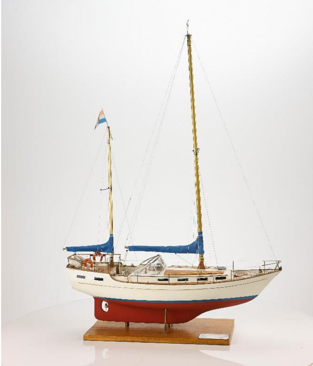
Full model Trintella IIIa

showcase the found models in a more permanent, online photo exhibition on our website. This way it will also be a lot easier to add new models and additional information.