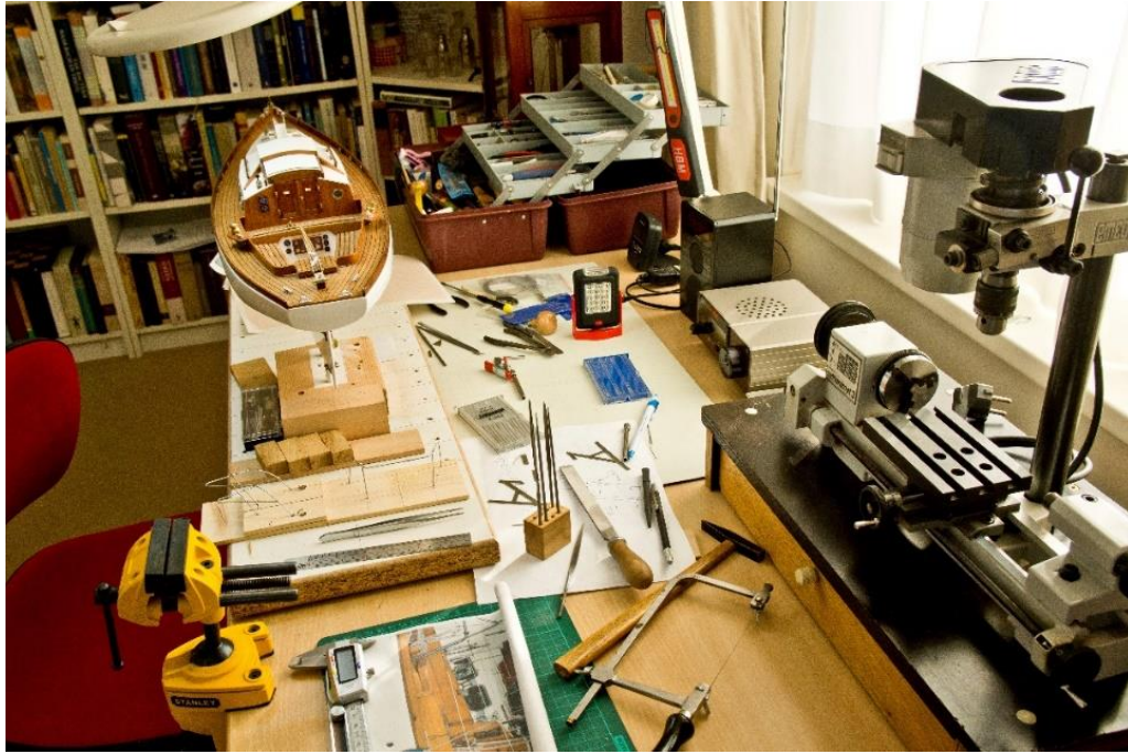
Studio where the Pimpernel (Trintella la) is being finished

Interested? How can I get my very own model?