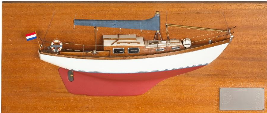
Half model Trintella la