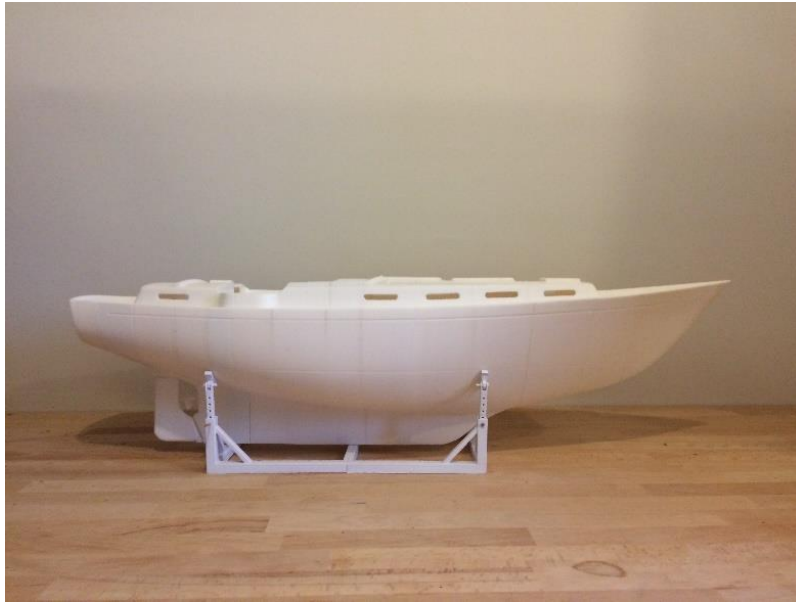
Example of Trintella III- 3D print