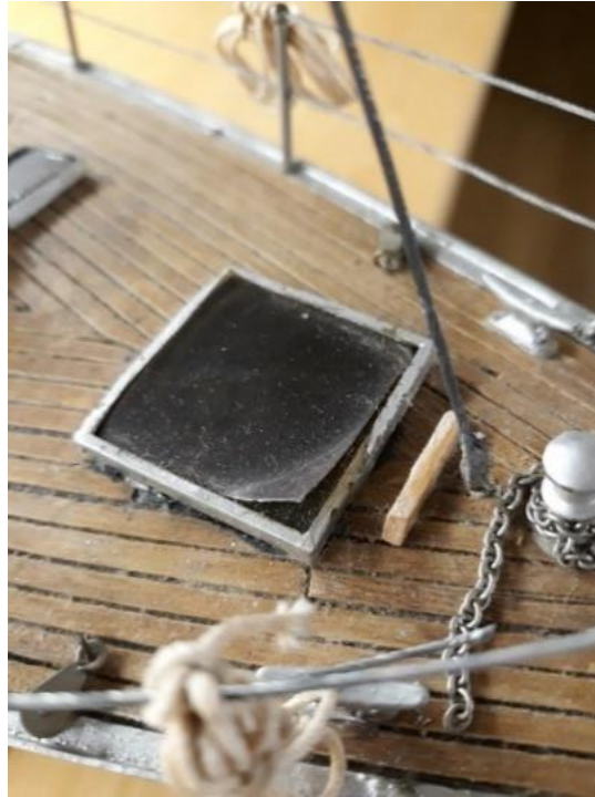
Trintella 57A for restoration

Sometimes our older, full-sized Trintellas are not in the best state either. They are at the cusp of a refit that will make sure the boat is good to go for many years to go.