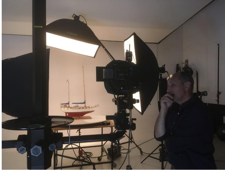
Photoshoot of Trintella IIIa in studio Peter Vincent van der Linden – Almere

A number of photographers came to our aid and we made arrangements with them to photograph the models. In some cases, the owners of the models took the pictures. The pictures may not have been taken in perfect studio conditions, but the models are worth viewing.