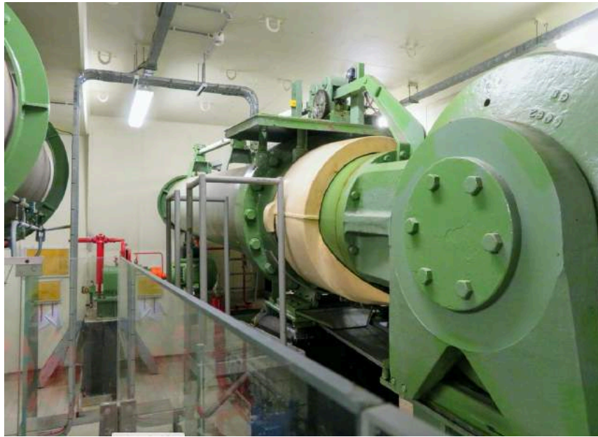
The engine room of the lock

The final dinner will be at the restaurant in the harbour, overlooking our ships.”