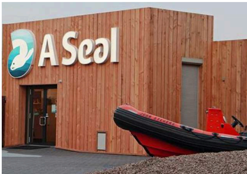
Seal sanctuary A Seal

and one more to the catacombs of the Haringvlietdam (subject to the cooperation of the Rijkswaterstaat).