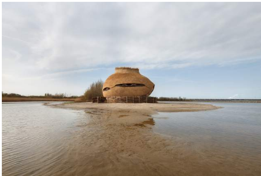
Bird observatory Tij