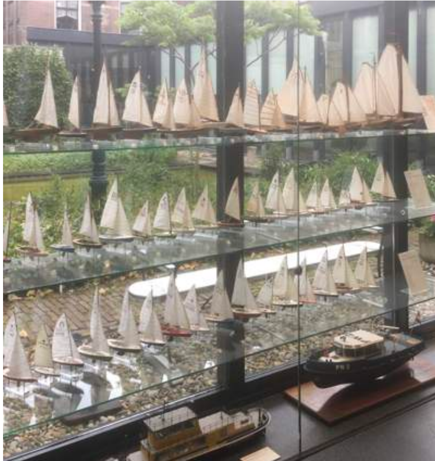
Models in the Frisian maritime museum in Sneek

You must have noticed that Dutch maritime museums have been paying a lot of attention to ship's models, not only to older models from previous centuries but also to newer models of ships and yachts. We have, however, still not spotted a Trintella yet.