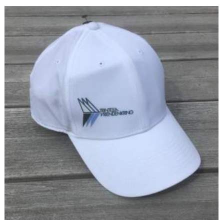
Nike € 23,50

We have decided not to deliver the Trintella tableware through the TVK anymore. The product scan be found in our catalogue still, but the orders will be processed by