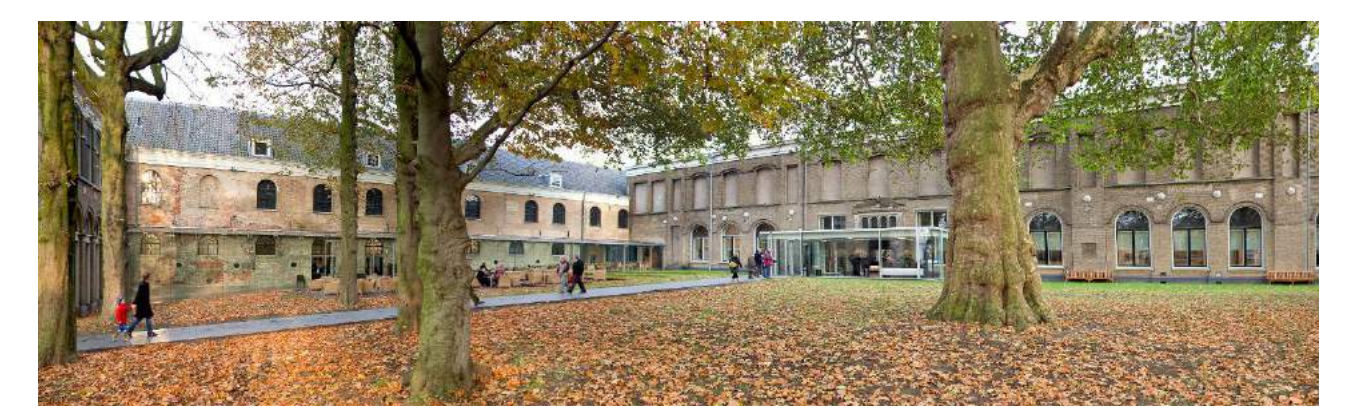
The Dordrecht Museum

In our last edition of the Newsletter, we announced the program for the Fall Reunion in Dordrecht on Saturday 16 November 2019. Since there is no new information to share, we refer you to the website for all known information. We will detail the program in the next Newsletter, with a link to the digital application form, as previously done with the Spring Meeting.