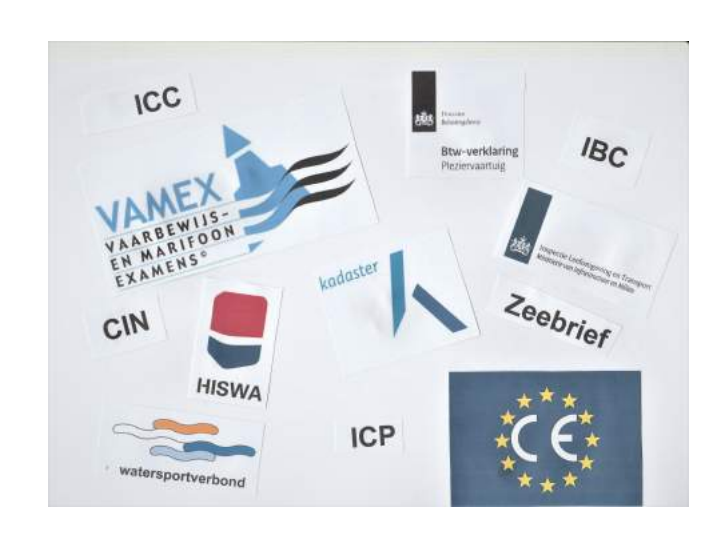
TB 018 - Registration and documents for pleasure boats

Inspiration for small or large jobs on your boat? You can find several reading recommendations in this TB.