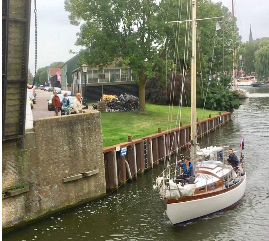
Picture: the Windveer with crew in the harbour