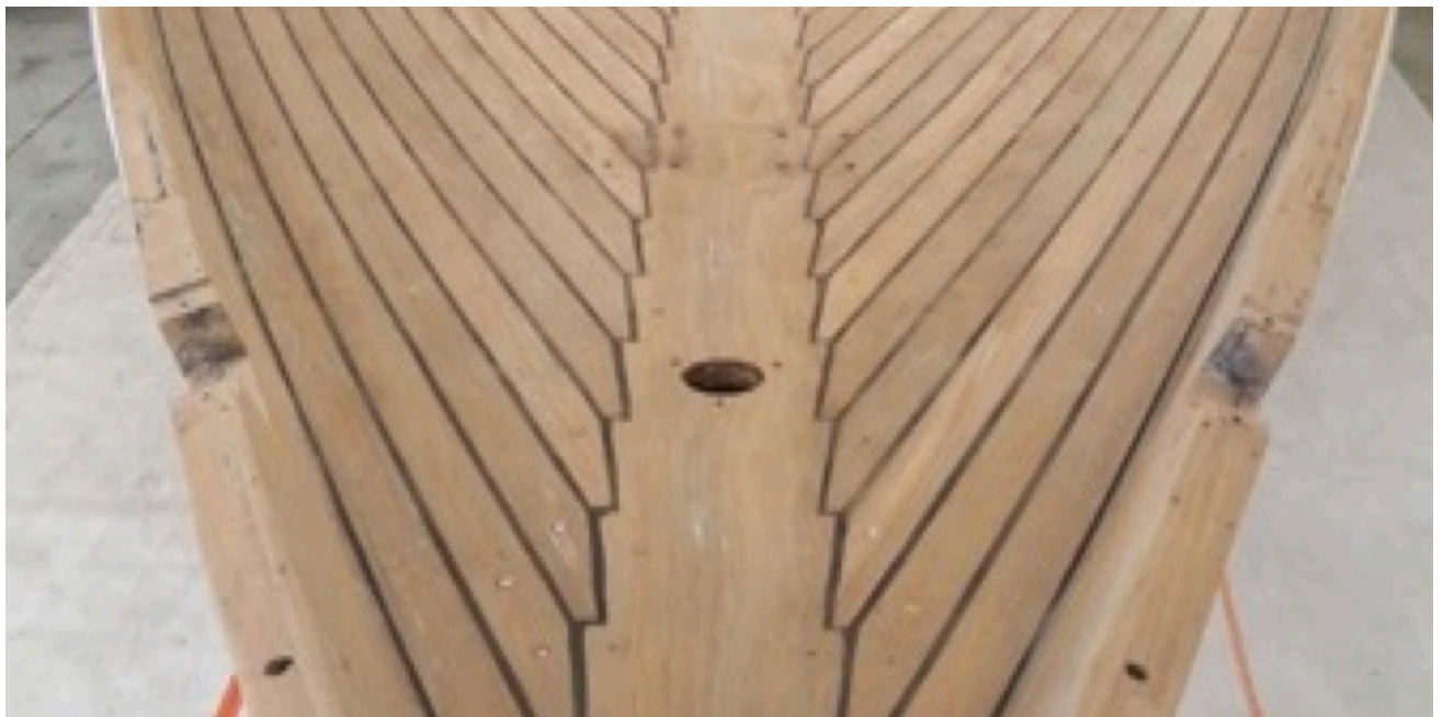
Photo shows that afterwards, the deck looks like new and can last for years.