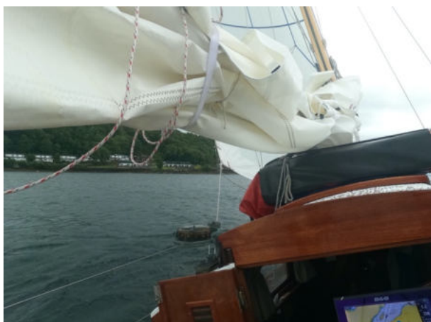
On the way to Craobh

to drop past Easdale Island to sail the Cuan Sound. Because I have a strong aversion to lee shore, this was quite the issue. You sail towards a rocky coast with a lot of breakers and two large antennae masts to aim for since you must pass between them. Having a plotter does ease the mind. Once inside, the waves disappeared but the wind also subsided, as well as the leeway of South Cuan. Because I had been so quick, I was an hour early in going in – meaning there was a strong outward current to push us back towards the entrance. I called upon the engine to pass through the Sound and a lovely little sun came out to see me towards Craobh.