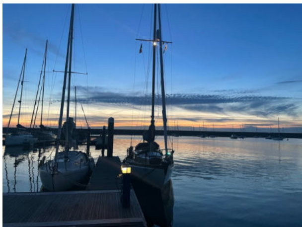
Sunset in Dun Laoghaire