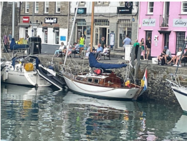
Castor Spica at the quay of Padstow

It's one of the most delightful harbors I've visited on this trip, highly recommended. The day started with hope but eventually, there was no wind, just a glassy Celtic Sea, Bristol Channel. So, I resorted to the motor, thankfully with lots of dolphins displaying their acrobatics. I arrived in Padstow just 15 minutes late; the lock closed at 10 PM.