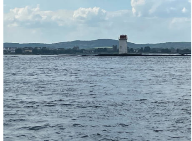
Entering Strangford Lough

jack of all trades. But man, is such an Irish pub a good time!