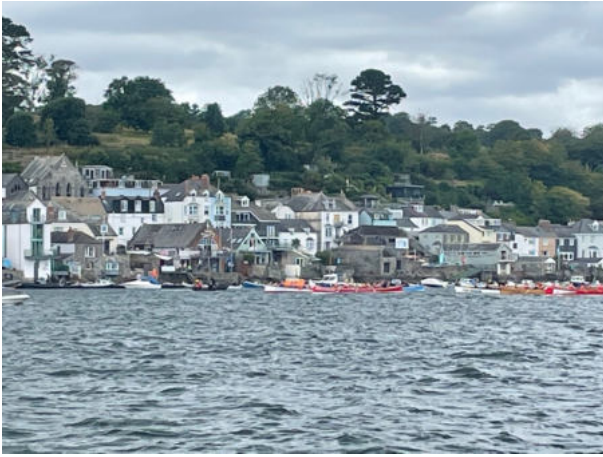
Fowey Gig regatta

From Fowey, I sailed to Salcombe with a forecast of a 3-5 south/southwest wind with showers, mist, and rain. I only encountered two of those showers with a fair amount of wind, but they passed in about five minutes. After 37 miles, I arrived in Salcombe with some sunshine. It's like Fowey but on a larger scale. You can tell Salcombe is a water sports paradise; you see everything from canoes to jet skis.