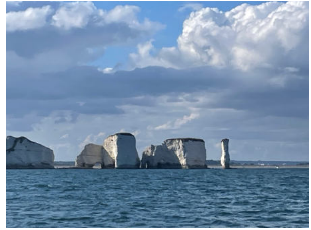
Near Portland Bill

Departed at 5:15 AM towards Weymouth with a beautiful southwestern wind. This made the boat sail at 6-7 knots through the water. Sailing into Weymouth was a treat. Despite the motorboats and jet skis' busy activity at the entrance, I decided to anchor peacefully at Goathorn Point near Brownsea Island. Soothing.