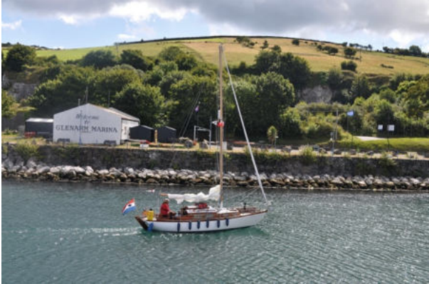
Castor Spica entering Glenarm

rainy day on Rathlin, my next destination was Glenarm. Again, I calculated the tides right and sailed into the North Channel with lovely weather. In Glenarm I met the crew of the Babar again, they made a series of pictures of the entrance. Glenarm is a small town with a beautiful castle, which is still inhabited. You can visit it and hear all about the juicy details.