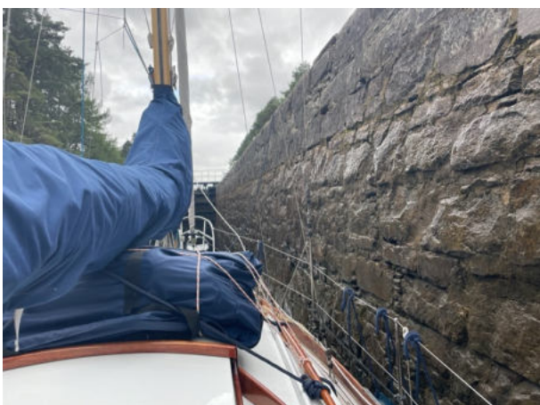
Gairloch Locks - Caledonian Canal

The next day I left during the first shift at 08:15 for Loch Ness, with a short stop after the lock of Dochgarroch.