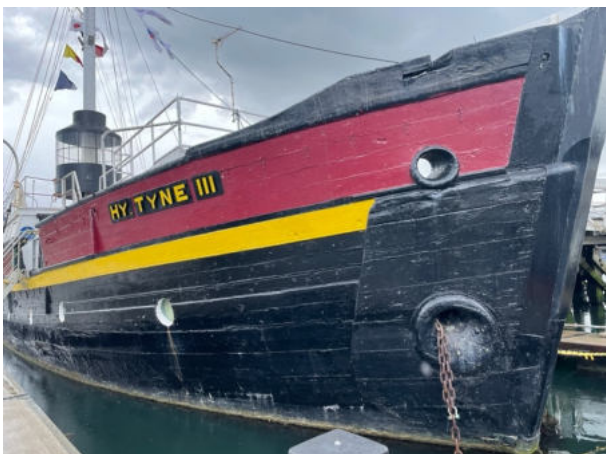
Blyth – club ship of RNYC

From Hartlepool to Blyth with the yacht harbor Royal Northumberland Yacht Club. The harbor isn't truly in the city center, but the club ship, the oldest still floating wooden lightvessel, is really lovely.