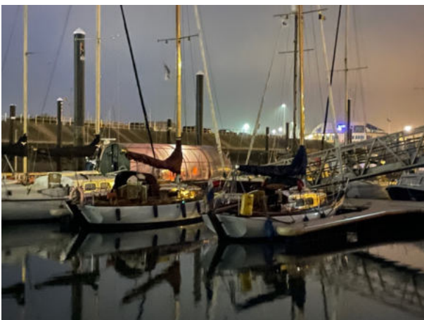
Castor Spica and Jadyca in Blankenberge