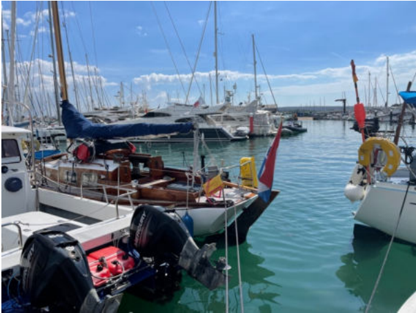
Castor Spica parked in Yarmouth

master, as larger boats were double moored both in front and behind.