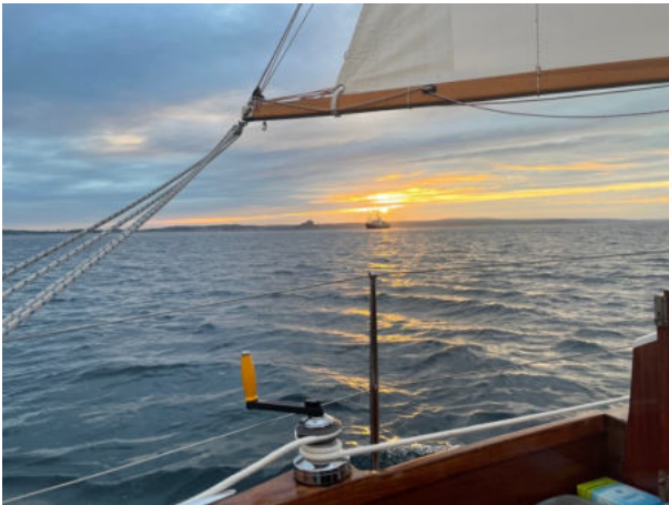
Castor Spica on the Celtic Sea

On August 13th, I embarked on a long 82-mile journey towards Padstow in Cornwall.